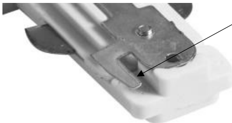
Earth tab must be inserted into "polarity groove" side only